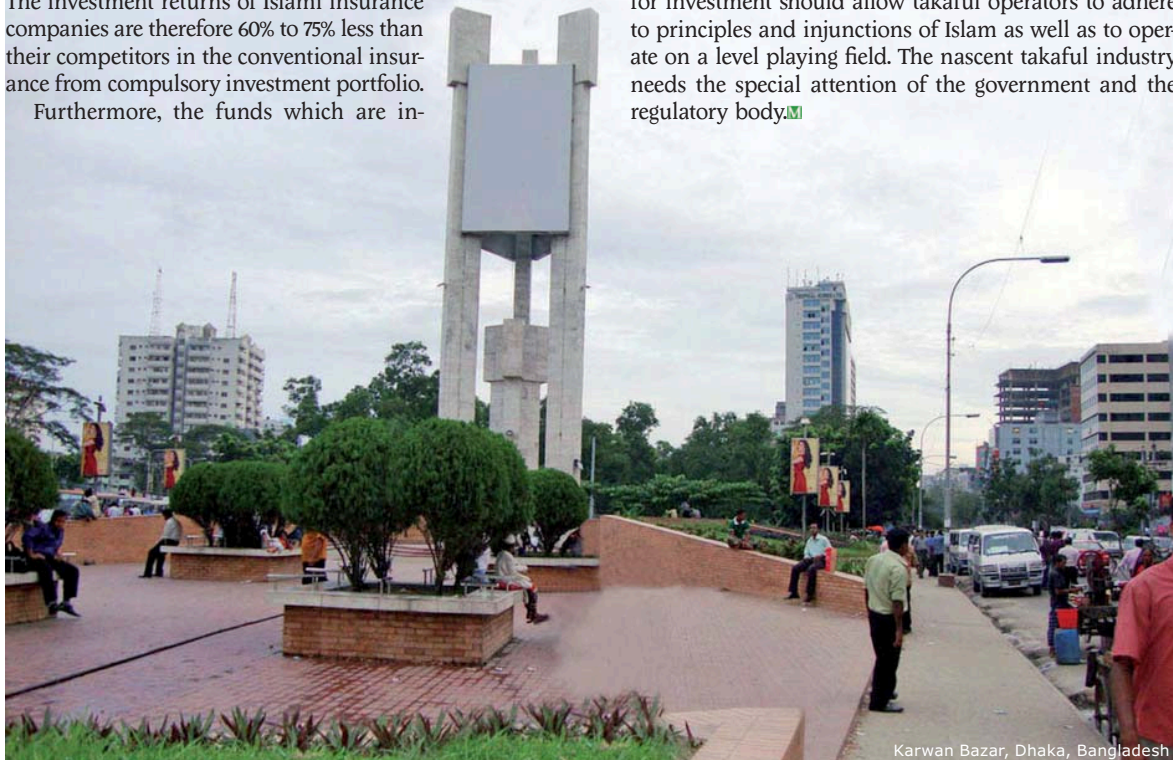
Karwan Bazar, Dhaka, Bangladesh