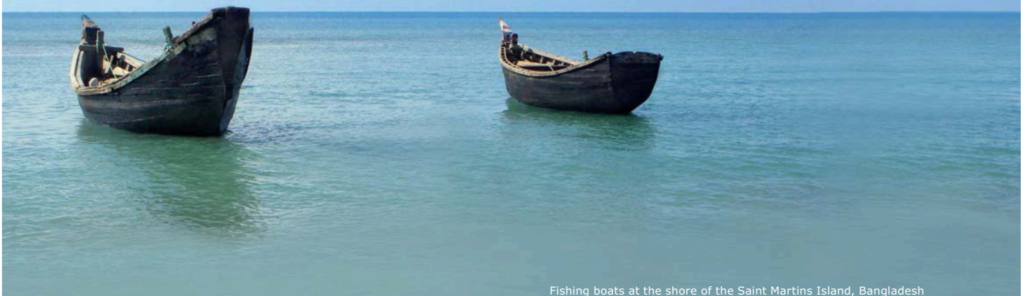
Fishing boats at the shore of the Saint Martins Island, Bangladesh

T akaful was introduced in Bangladesh to meet the demands of Muslims – who form 85% of the population – to conduct their economic activities in line with Shariah. This has proven to be a viable alternative in providing insurance coverage for risks incurred in financial transactions as well as the avenue for financial planning needs that are in line with Shariah needs.